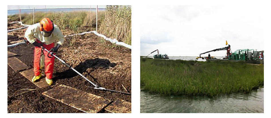
FIGURE 3.3 Aggressive remediation of oiled shoreline in Bay Jimmy (Barataria Bay, Louisiana). Left: cleanup crews manually cutting oiled vegetation (Zengel and Michel, 2013). Right: mechanical removal of oiled material.

excavation attachments, allowing crews to scale up aggressive treatment techniques, but with less precision than manual remediation and increased potential to damage marsh soils. Heavy machinery also enabled debris to be transferred directly from the marsh to offshore disposal containers.