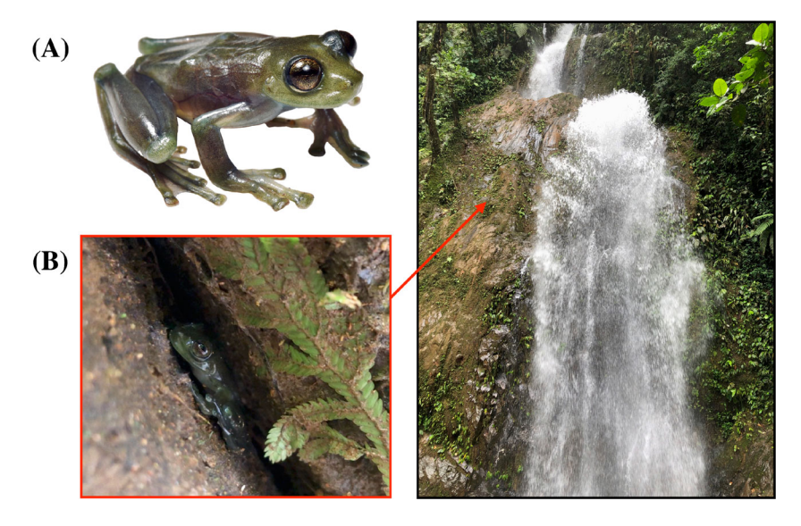
Figure 1. (A) Sachatamia orejuela . (B) This species is found in the spray zones of waterfalls.

latopalmatus from Borneo (Grafe & Wanger, 2007). Each of these species call and visually display near rushing water, but belong to different families on different continents: a clear example of behavioural convergent evolution.