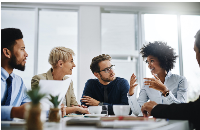
Figure 2. Shot of a group of professional people of various races and genders seated at a table and having a discussion.

groups. Task sharing refers to the extent to which an organization and the public work together for mutual benefit. Lastly, assurances refers to the lengths to which an organization assures the public or company their concerns are legitimate and the organization is committed to maintaining the relationship. Considering online organizations use all six of these strategies, personal users can use them in online science communication to build relationships as well.