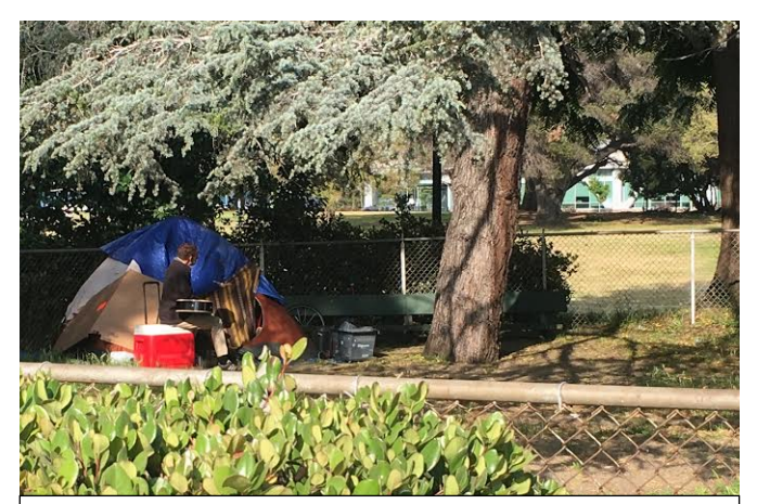
Mosswood Park, Gated Play Area Left of Moss House June 6, 2018