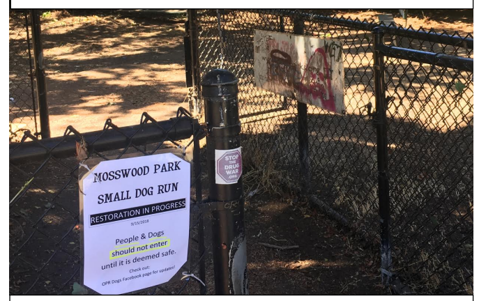
Mosswood Park, MacArthur Freeway Side June 9, 2018