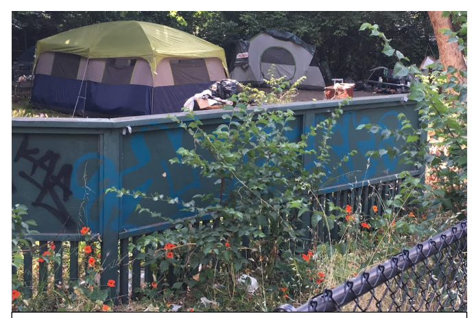
Mosswood Park, MacArthur Freeway Side June 6, 2018

gated area of the dog park, along the pergola, and the amphitheater adjacent to the original recreation center (see Image 3). The increase in the encampments created by unsheltered Oaklanders at Mosswood Park is indicative of a larger municipal and state crisis in which steep rents and high-end luxury housing have eclipsed the housing supply of public, low-income, and affordable housing, as described in more detail above. This volatile gentrification process of displacement and eviction alongside the tech industry tsunami has left a rising number of unsheltered formerly housed Oaklanders in its wake. The stark divide between the haves and the have-nots is making itself visible within Oakland public parks.