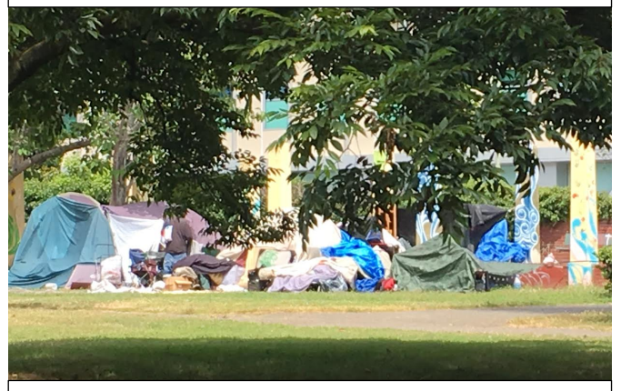
Mosswood Park, Pergola Broadway Side June 6, 2018